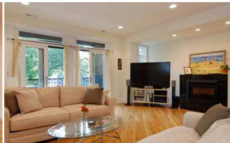
Ample Recessed Lighting with "Green" Fireplace and Diagonal Hardwood Floors Throughout