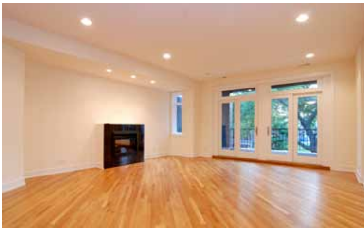
Oversized Sun Drenched Living Room with Double Sliding Doors and Ample Recessed Lighting