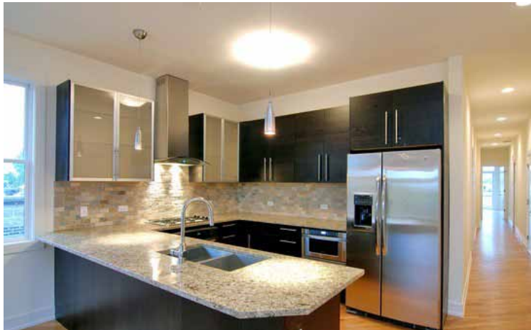
Chefs Kitchen with Hood, Pullout Microwave and Cooktop