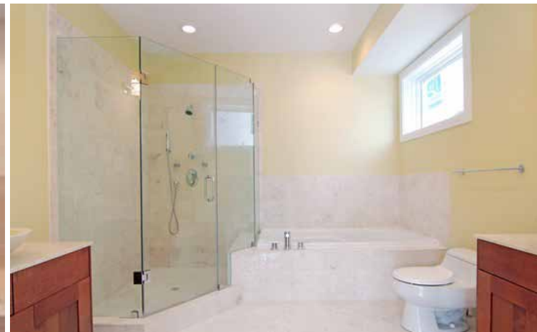
Extra Large Glass Shower Body Sprays and Dual Vanities