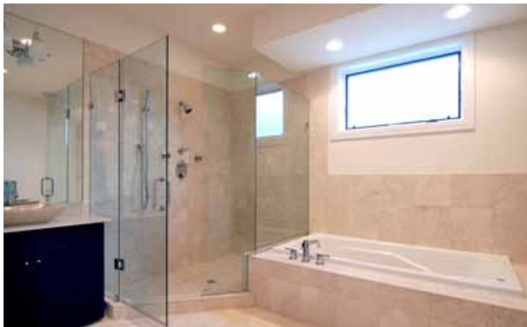
Spa with Heated Floors, Oversized Jacuzzi and Vessel Bowls