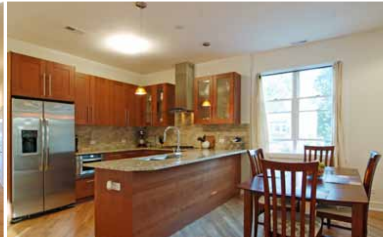
Granite Counters and GE Appliances with Stone-Tiled Backsplash